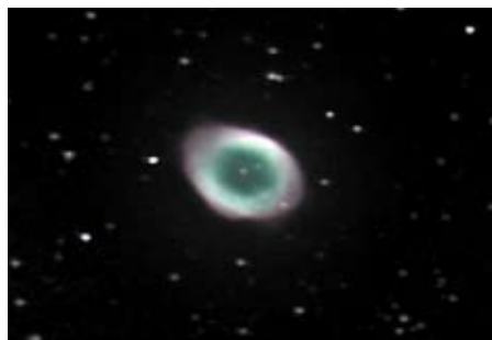
The Ring Nebula (M57) in Lyra is a planetary nebula whose gaseous envelope glows as it absorbs ultraviolet light from the central star and re-emits it at visible wavelengths.

I have tried three software packages that enhance the output of these cameras. Because the MallinCam can capture AVI movies, I use the free software package Registax to align and stack the images. This program allows my 8-inch scope to reach a limiting magnitude of 19 when using the 14-second integration mode.