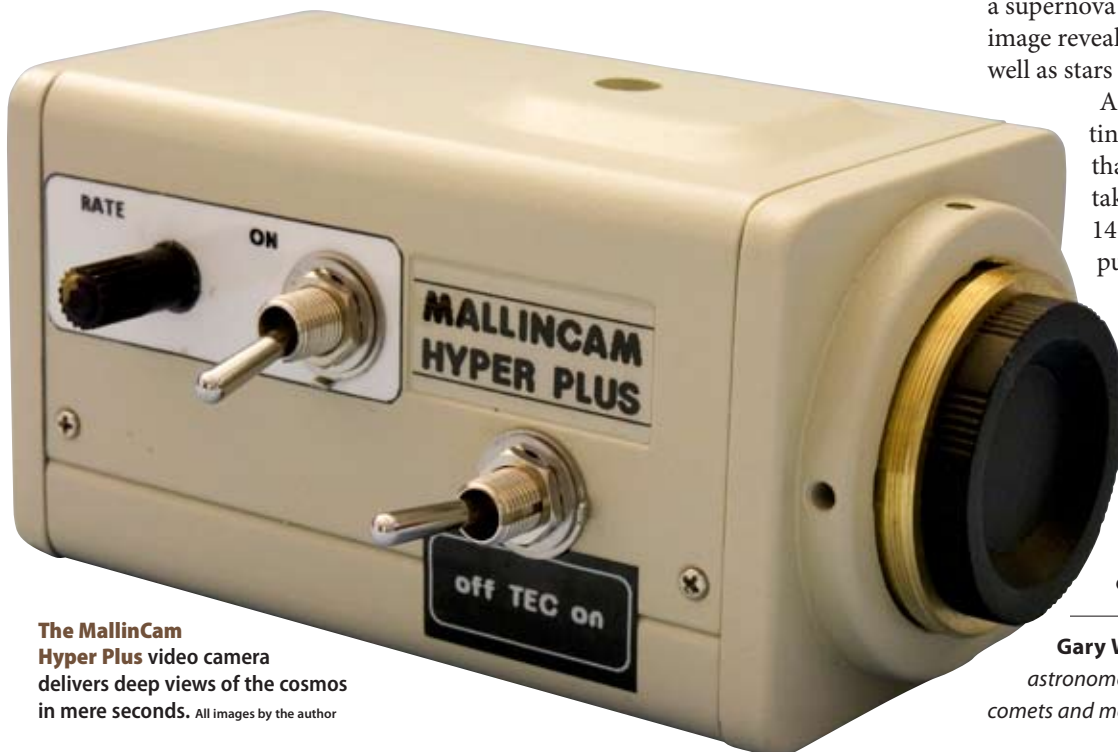
The MallinCam Hyper Plus video camera delivers deep views of the cosmos in mere seconds.

Gary W. Kronk is an avid amateur astronomer who specializes in observing comets and meteors.